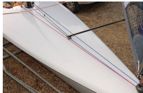
A jib stick used to push the jib boom out

Jib stick kits are now available from Vandercraft for pushing the jib boom out when running. The kit can be fitted quickly to any boat and retails at £85 ex VAT – contact Jeff at Vandercraft for details.