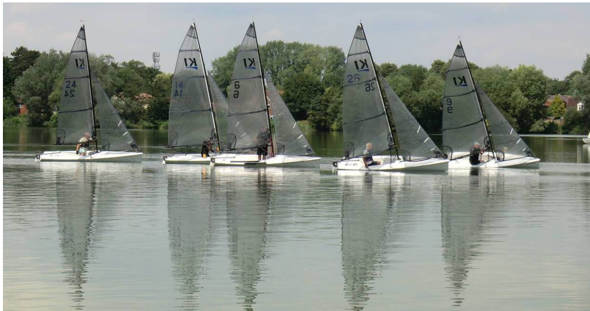
K1s racing in light airs at Broxbourne Sailing Club

The season is now well underway and successful K1 open meetings have been held at Oxford, South Windermere and Broxbourne Sailing Clubs together with some well-attended training sessions. K1s have also enjoyed considerable success in handicap races both at club level and in big open events with a K1 winning the Exmoor Beastie. The fleet continues to grow with 50 K1s now sold including recent sales overseas.