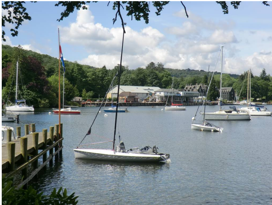
K1s moored at lunchtime on Windermere

Further information on the K1 keelboat is available www.K1sailing.com